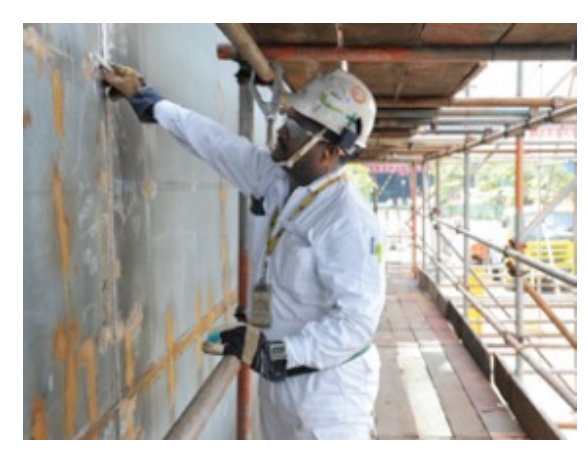
Figure 6 Working platform with guardrails and toe boards installed