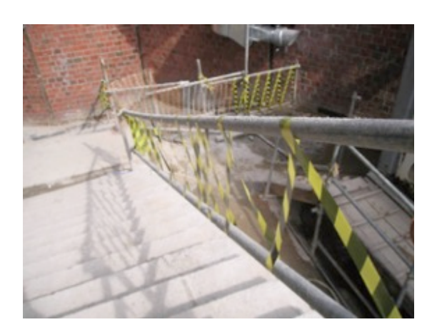
Figure 2 Handrails at open edges of stairway