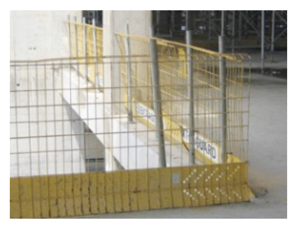
Figure 1 Perimeter guard-railing