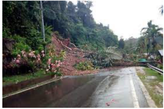
Landslide blocking a road in Brunei.

Increasing severe weather events pose a constant threat to worksite safety as heavy thunderstorms with strong winds increase the risk of falling trees or branches, slippery surface conditions, flash floods, landslides and damage to assets. This can lead to dangerous conditions for workers such as being exposed to electrical hazards, slips and falls, reduced visibility, structural instability especially in construction sites and equipment malfunction due to exposure to water from the rain. Workers aboard marine vessels, ferries and offshore platforms should also be vigilant of rising water levels and choppy sea conditions.