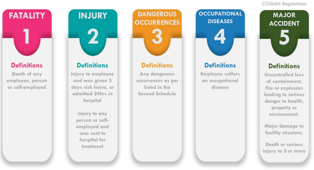
Figure 3: Type of Reportable Incidents

Depending on the type of accidents/incidents, such as listed in Figure 3 below, the employer or occupier shall contact the SHENA Duty Officer on mobile no. (+673 7332200) and submit an initial incident report to SHENA by filling in an initial incident notification (IIN) (Appendix 1) not later than 10 days as specified in Workplace Safety and Health (Incident Reporting) Regulations, 2014. The IIN shall be submitted to <u>iin@shena.gov.bn</u>. All incidents should be investigated by the educational institution and records kept.