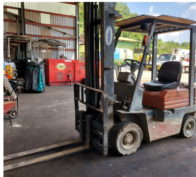
Photo 1 of forklift Truck with worn-out tyres

During ongoing regulatory inspections by the Safety, Health and Environment National Authority (SHENA) in enforcing the WSHO, 2009 and its regulations across all workplaces in Brunei Darussalam, it has been noted that FLT are routinely used at the warehouses and logistic facilities for loading and unloading of cargoes. Generally, the majority of these FLT have been found to be in a poor condition, not maintained on a regular basis, lacking any evidence of inspection certification. In addition to this, there appears to be a lack of training provided by employers to FLT operators.